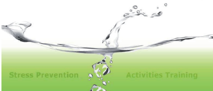
Placard of the Hungarian training

Further trainings took place in Slovakia at the Technical University of Kosice on 31st May and 1st June, and in Bulgaria at the Technical University of Varna on 14th and 15th of June.