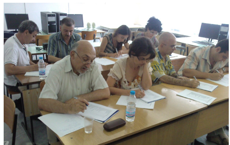
Preparing in Varna

Further trainings took place in Slovakia at the Technical University of Kosice on 31st May and 1st June, and in Bulgaria at the Technical University of Varna on 14th and 15th of June.